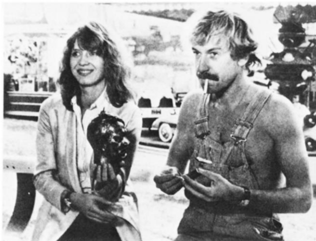
KINGS OF THE ROAD

In this way each sequence of shots refuses to capitalize on the momentum of the preceding sequence, or even on itself. Accordingly, the film seems to be constantly starting out down new roads after making false detours. Episodes remain isolated moments, unlinked. Hence, In the Course of Time (a more truly ironic title than the American one, Kings of the Road ) is a film about the discontinuity of time, and this is perfectly in keeping with that disturbing subcurrent of feeling that runs through most of Wenders's films, the feeling that the characters have no real future—disturbing precisely because it corresponds in some unspeakable way to our own feelings that the world itself seems to be winding