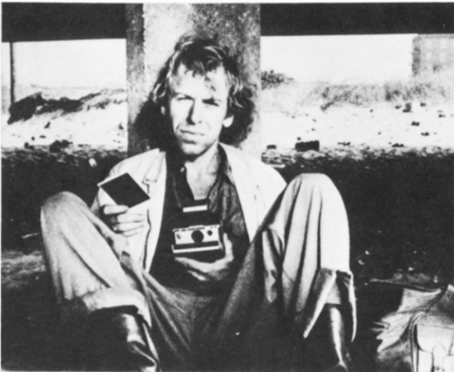
◀ ALICE IN THE CITIES

After murdering a movie house cashier in her apartment in a scene that is shot in a deliberately understated way, Bloch carefully wipes his fingerprints off everything he has touched. But the camera notices two American coins, souvenirs of a recent soccer tour, that he missed under the newspapers on her kitchen table. A short while later on a bus when some American coins fall from his pocket, an elderly woman brings them to his attention. And when he pays for a hotel room, he accidentally gives the manager an American