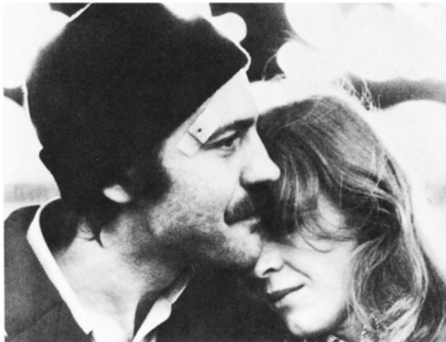
THE AMERICAN FRIEND

Yet it’s Ripley, the psychopathic American se-