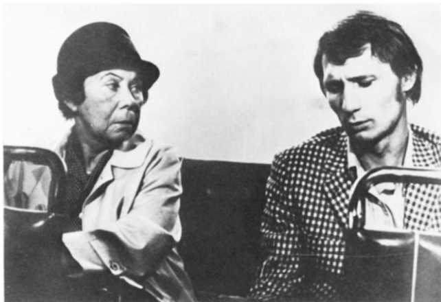
THE GOALIE'S ANXIETY AT THE PENALTY KICK

Many of Wenders's films contain direct homages to John Ford who, with his feel for overwhelming skies and disquieting environments that isolate his characters, has clearly been an influence. But I think it is more properly Bresson, with his precise camera work, who has been a stronger influence. One of the few films I have seen that captures so painfully well this sense of things always going awry, always closing in on one, is Bresson's Mouchette (1967). Even Wenders's static camera, with the characters moving in and out of the frame, is reminiscent of Bresson.